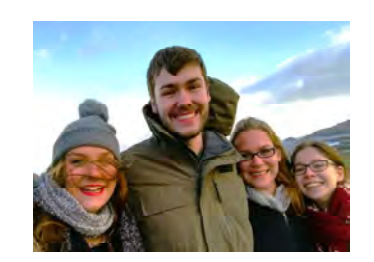
Follow your dream

Presbyerian-founded schools stretch across the continental U.S. from St. Petersburg, Florida to Spokane, Washington—and around the world from San Juan, Puerto Rico to Daejeon, South Korea serving nearly 150,000 students each year.