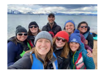
Fulfill your destiny

Presbyterian-founded schools are diverse and affordable. Over 35% of the students being served are people of color and nearly two-thirds are the first in their families to attend college. More than $2.1 billion in financial aid dollars is awarded to