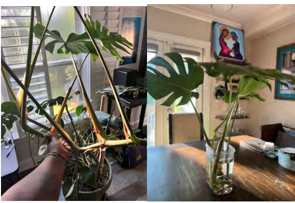
"Pruning & Propagating"

Vital Congregations Initiative – Mark #7 – Ecclesial Health