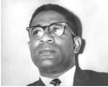
Gayraud Wilmore, ca. 1960